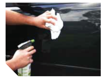
The surface of the vehicle & surface of the magnet must be clean and dry.