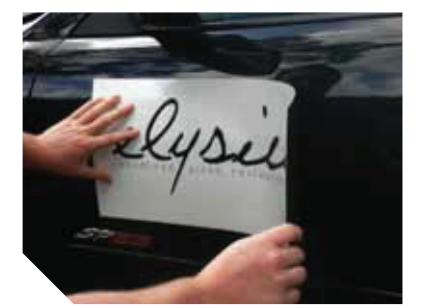
Apply magnetic sheet directly to the vehicle. Do not pull magnet to reposition