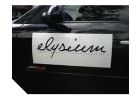
Ensure magnet is applied to a smooth and flat surface. avoiding any bumps or groves