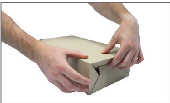
Step 4: Fold the last flap and then push it back simultaneously with the U-shape flap until it snaps into the slot.