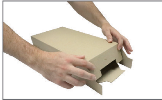
Step 2: Fold the large flap with the U shape inwards.