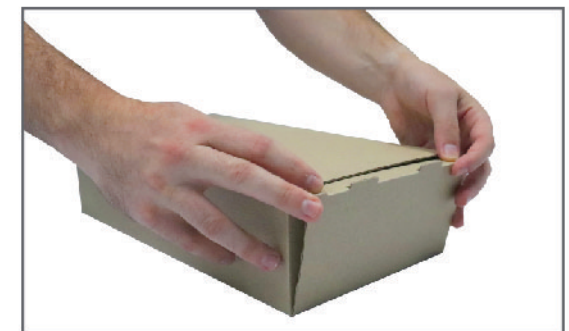
Step 6: Close the lid to complete the box