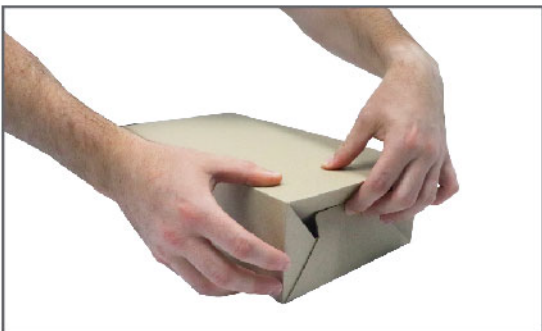
Step 4: Fold the last flap and then push it back simultaneously with the U-shape flap until it snaps into the slot.