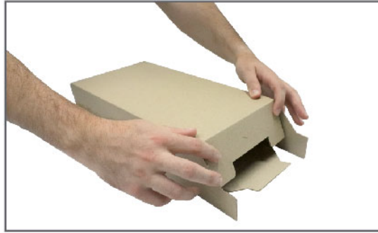
Step 2: Fold the large flap with the U shape inwards.