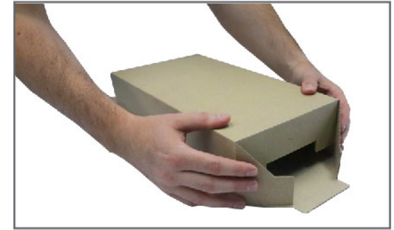
Step 3: Fold both the side flaps