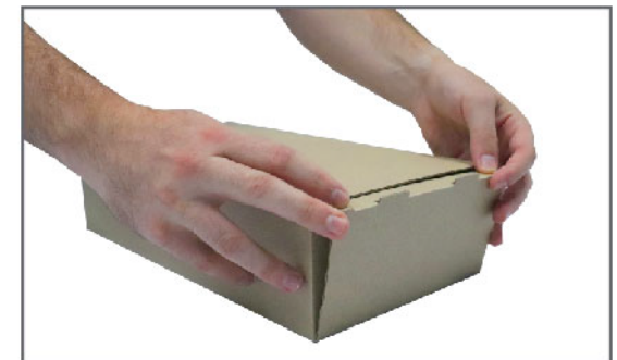
Step 6: Close the lid to complete the box