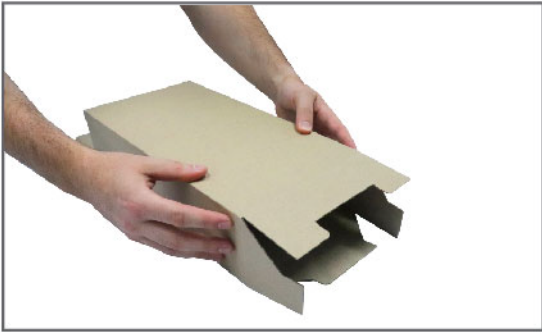
Step 1: Unfold the box so it is no longer flat