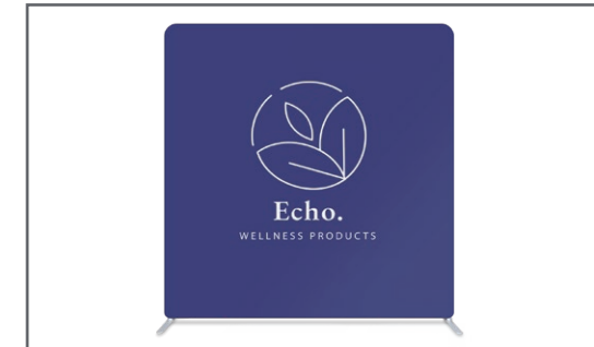
Step 6: You should now have a great looking Stretch Fabric Media Wall!