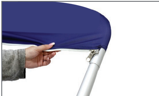
Step 4: Unzip the bottom of your banner and begin feeding the banner over the pole set. Start in one corner and then move onto the next corner. Then evenly pull the entire banner to the bottom of the pole set.