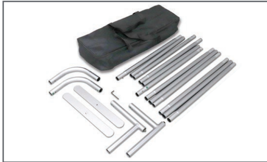
Step 1: Unpack all the contents of the carry bag.