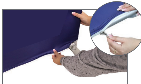
Step 5: Finally, pull the banner down tightly. This step is much easier with some assistance. So ask a friend if they can connect the zipper and begin closing the zipper, while you maintain tension on the banner.