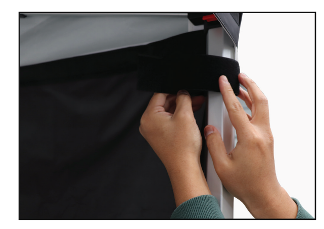
Step 4 : Grab the support straps and wrap around the pole making sure you velcro it securely.