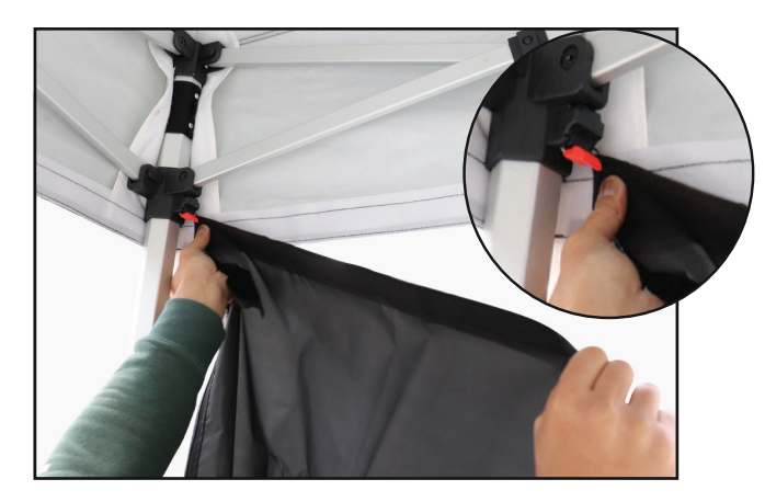
Step 2 : Holding the corner edge of the velcro strip carefully align to any inner velcro corner of the Gazebo.