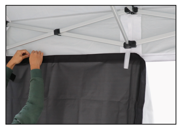
Step 3 : Starting from the corner, align the rest of the velcro linings together by pressing down whilst keeping a pull on the back wall material with your other hand.