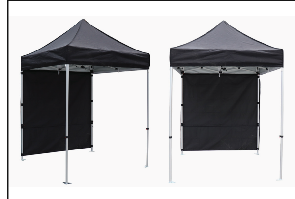
Step 6 : You should now have a great looking gazebo and back wall.