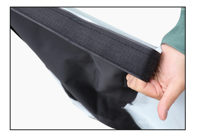
Step 1 : Find the velcro lined edge on the Gazebo back wall.