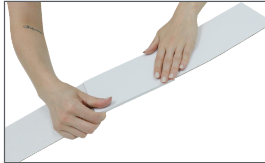
Step 2: Fold the insert in half along the two centre score marks so that the score marks are not shown.