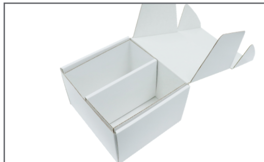
Step 5: Your Mailer Box with Inserts is now ready to go!