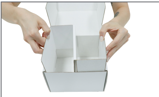
Step 4: Place the insert into the box. Please note you may need to angle the end panels inwards to position the insert correctly and then fold them back out to ensure the insert stays in place.